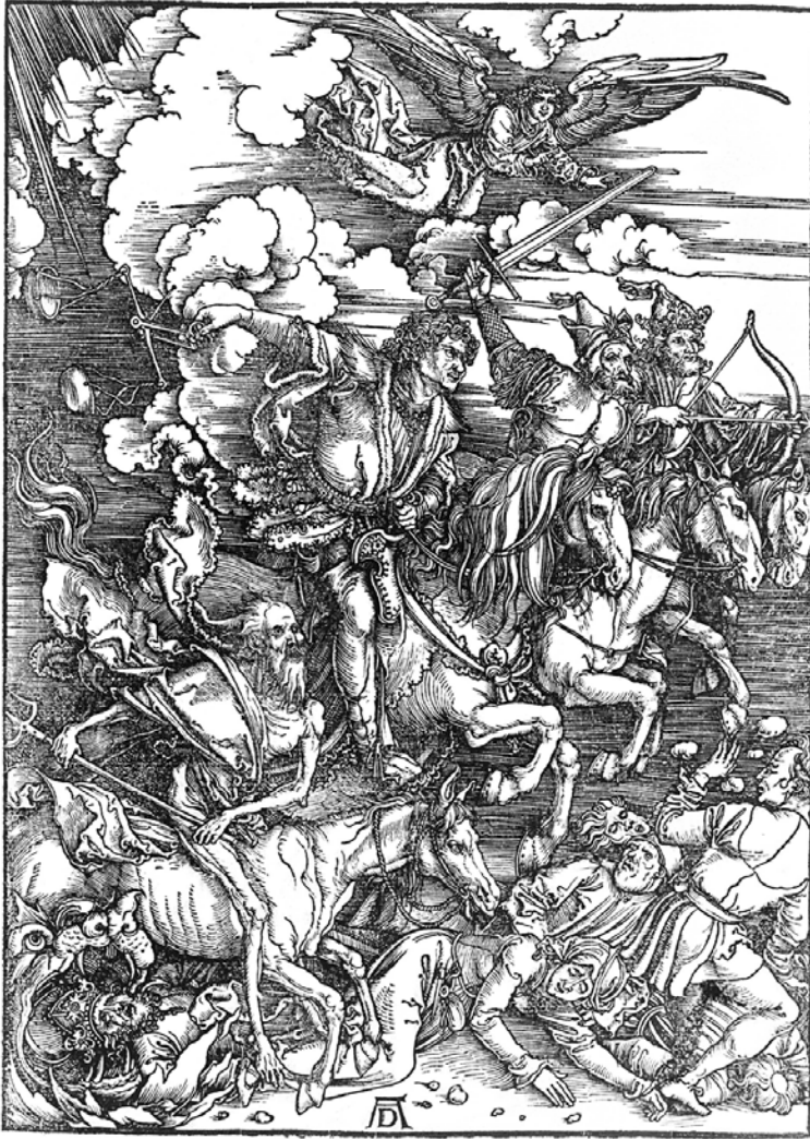
The original spread of the pandemic of what is called “monetarism” today, LaRouche writes, “is often to be blamed on ancient Babylon, as that was done, implicitly, by no less an authority than the Christian Apostle John, in what he presented as his dream of an Apocalypse.” Shown: Albrecht Dürer’s woodcut, “The Four Horseman of the Apocalypse” (1511).

Shelburne adopted, explicitly, from the legacy of the notorious Roman emperor Julian the Apostate, to induce nations to destroy themselves by swindles of that sort. Swindles such as British schemes for supranational “world currencies” are much safer, and often more feasible weapons of mass destruction than nuclear ones, provided that credulous dupes can be found among governments of the intended victims.