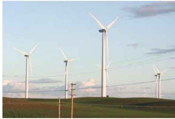
GNU free documentation license

Although, in the animal kingdom, we have the natu-