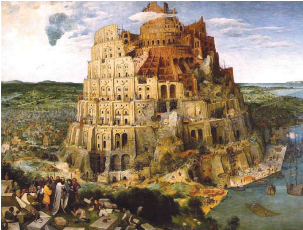
We should resist the proposals for “globalization”—as in the “Tower of Babel”—with at least as much determination as we would resist fascism. “The proper name for ‘globalization’ is, ‘Satan and his humanoid beasts live here.’” Shown: Peter Bruegel the Elder’s “The Tower of Babel” (1563).

human mind are summoned and honed in manners which, in turn, promote the development of the individual power of creativity which is then applicable to the matters of physical science and physical production.