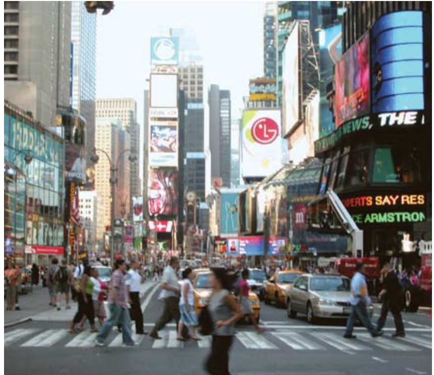
Mankind's higher relative potential population-density, compared with that of the "higher apes," for example, depends upon those noëtic powers unique to humankind, among all living species. Above: an orangutan; right: Times Square, New York City.