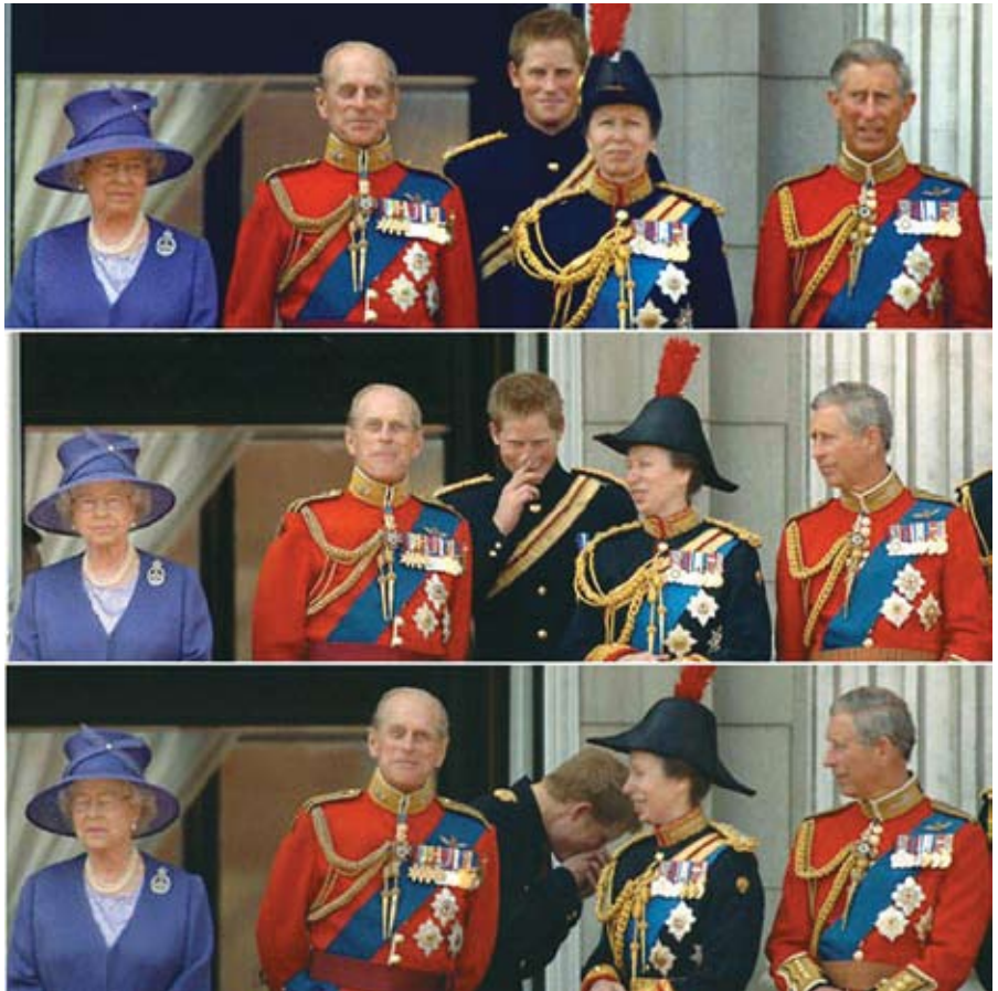
Prince Philip (second from left) is, in both word and practice, the greatest genocidalist in known world history to date. Even the other members the Royal Family seem to smell something foul emanating from the decrepit Duke of Edinburgh.

The essential distinction of a society premised on the notion of the modern sovereign nation-state, such as the American System expressed by the U.S. Declaration of Independence and Federal Constitution, is its distinction from, and opposition to empires such as the present con-