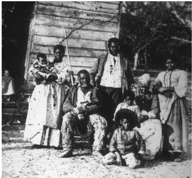
Nothing demonstrates the species-difference between the American and British systems more dramatically, than the British imposition of, and maintenance of the system of chattel slavery within the territory of the U.S.A., until Appomattox. Shown, a 19th-Century slave family in South Carolina.

The origin of the American System lies, essentially, with a policy adopted by the principal founder of modern science, Cardinal Nicholas of Cusa, who had also introduced, earlier, the design adopted, during the Fifteenth-century Renaissance, for the modern nation-state, within his Concordancia Catholica . Cusa had also established the principle of all competent modern