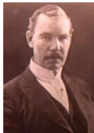
Arthur Cecil Pigou,

The policy has its roots in the fascist ideas of British economist and Cambridge University professor Arthur Pigou, who worked closely with John Maynard Keynes during the 1930s. In a 1920 book entitled, The Economics of Welfare , 1 Pigou argues that the way to change a behavior, is to tax it out of existence. With cap and trade, you tax energy until it becomes too expensive, and this, in turn,