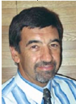
University of Greenwich Public Services International Research Unit

Another possible configuration is a co-generation plant that produces both elec-