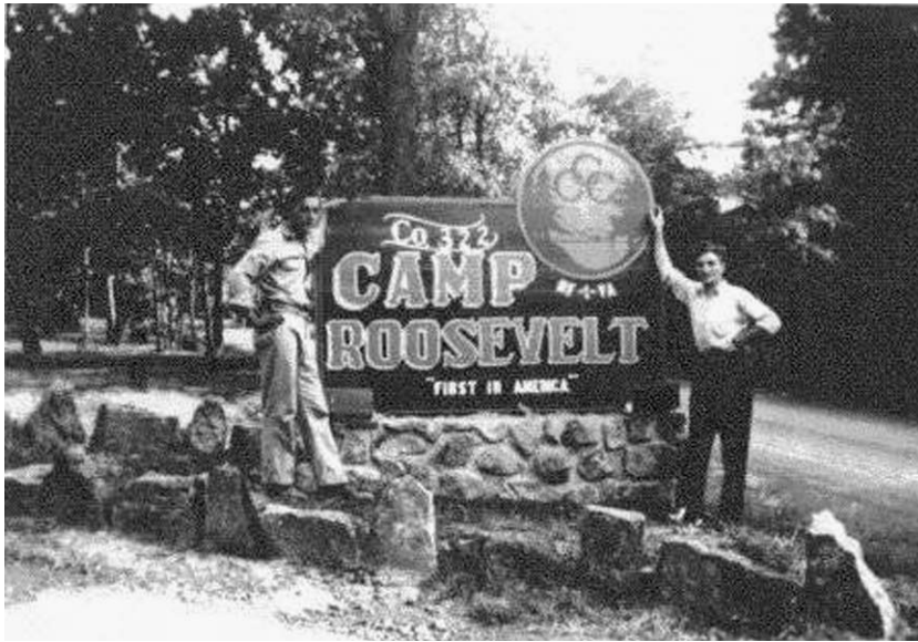
A national jobs program for the United States will be modelled on President Franklin Roosevelt's Civilian Conservation Corps (CCC), which trained millions of young people for productive work in the 1930s. Shown: Camp Roosevelt, George Washington National Forest, Edinburg, Va., the first CCC camp in the U.S., established April 1933.

omy as a whole, there will also be millions of jobs required for urgent tasks such as building hospitals, repairing or constructing new levees on the collapsing U.S. waterways system, and rebuilding decaying urban infrastructure.