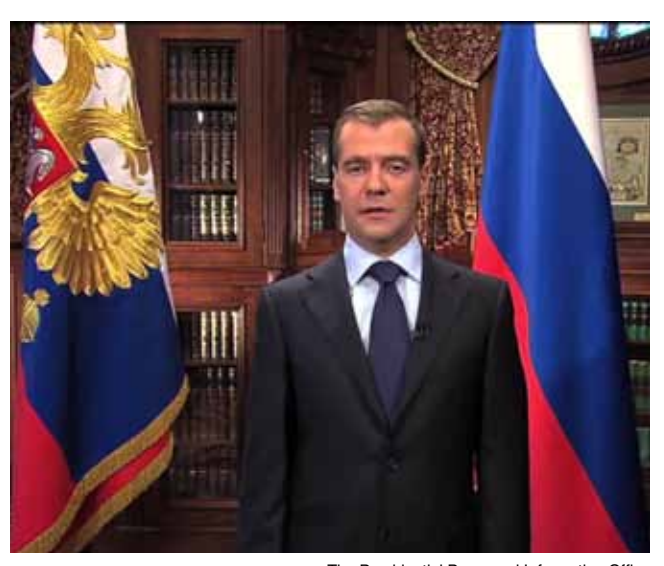
Russian President Dmitri Medvedev's Nov. 23 televised address to the nation, shown here, was also a solemn warning to the West that Russia will not accept the current drive for war in

The military leaders of Russia and China, who reacted strongly against President Obama's assertion of leadership in Asia, are determined to make clear to all that they will not sit idly by while Syria and Iran are attacked, but rather, have begun a very serious mobilization to block such attacks. Both Russia and China have realized that the real targets are not Syria and Iran, but they themselves. Therefore, any capitulation to American, British, or NATO attacks on these two states would