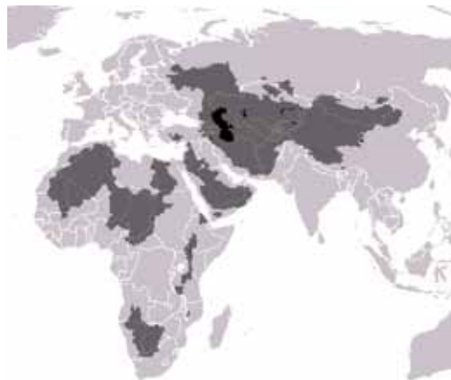
Major endorheic (closed drainage) basins which retain water, allowing no outflow to rivers or oceans.