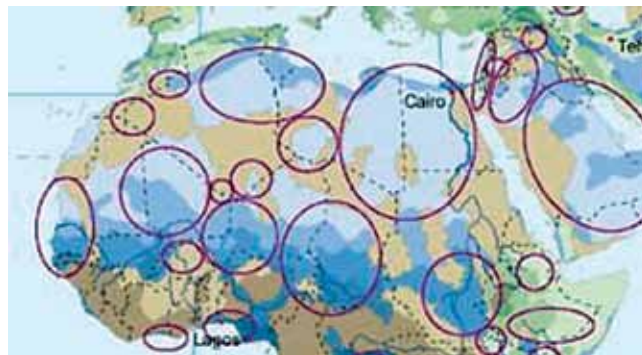
Aquifers under the deserts are revived by a system of aqueducts.