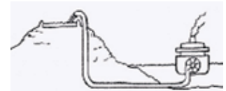
A concrete reservoir is placed at the top of the hills overlooking the coastline.