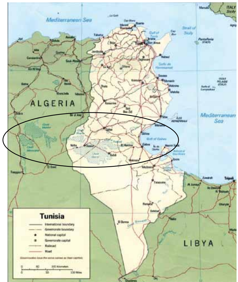
FIGURE 1 Location of the ‘Inland Sea’ Project