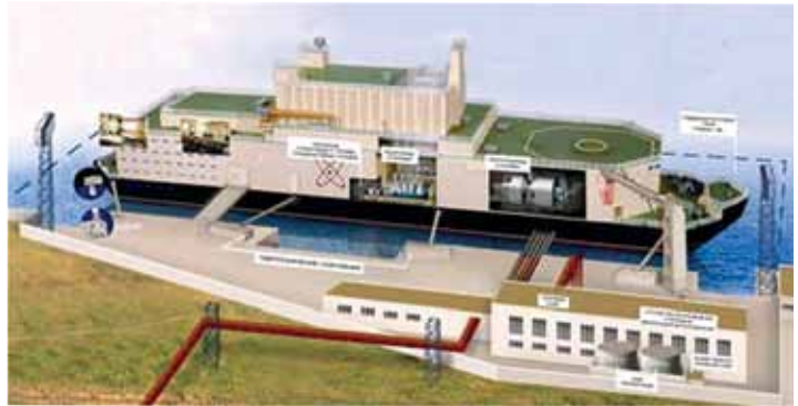
A ship arrives at the port of Gabès, carrying a strange object.

Our children are curious: "Daddy, tell me again about the four phases of the Blue Revolution.