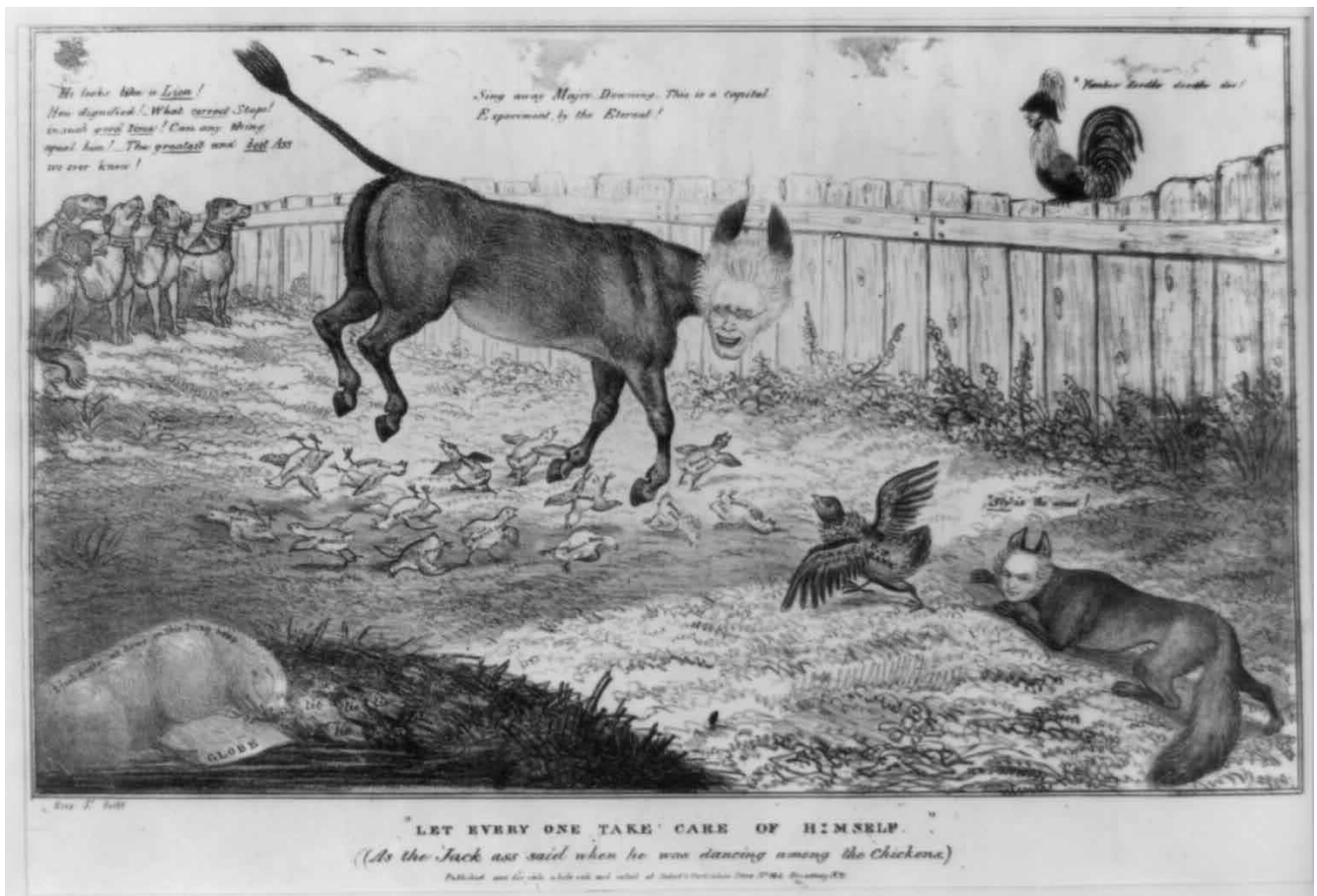
This cartoon, captioned “Let every one take care of himself,” attacks President Jackson’s plan to distribute Treasury funds, formerly kept in the Bank of the United States, among “branch banks” in the states. Jackson appears as a jackass, “dancing among the Chickens” (the branch banks), to the alarm of the hen “U.S. Bank.” Other political figures of the time look on, including Martin Van Buren, the fox at the lower right.

the currency, not the products of growth. The merchants may be exchanging the same goods that they would be with a hard-money system, but the saving is made possible by a nationwide regulation system and government control, which makes all the transactions on credit possible. Without the regulation and national Banking structure, growth on credit and long-term investment is not possible. Without the regulated exchange rates which the Bank of the United States created through its national power, there was no long-term assurance in investment, and all transactions accomplished by the various private and local substitutes served as, in effect, a large tax upon all sectors of the economy.