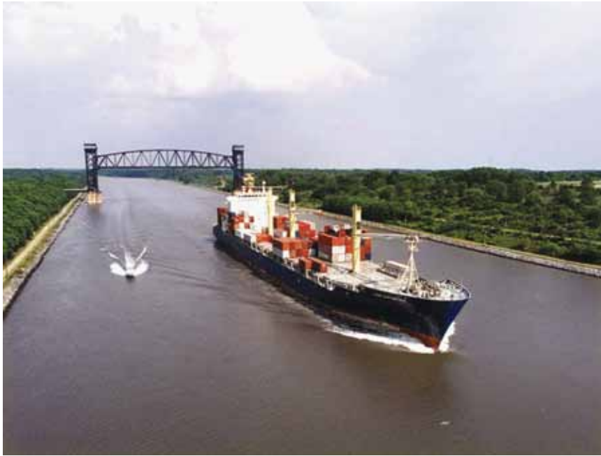
U.S. Army Corps of Engineers

Results of the program of internal improvements included the Chesapeake & Delaware Canal (shown as it looks today), which was financed in part with a $1 million loan from the Bank of the United States.