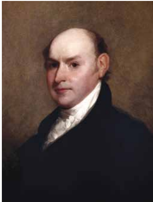
The White House Historical Association

President John Quincy Adams utilized the Bank for financing large projects, purely within the profit of the credit system itself, without borrowing money. Painting by Gilbert Stuart, 1818.