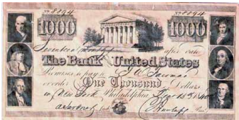
A promissory note issued by the Second Bank of the United States. The creation of a uniform currency of banknotes created a dependable means of payment, replacing the hodge-podge of currencies of the various states.

in making shipments to Europe, could cash his bill on credit, drawn against such shipment, without charge for brokerage. The planter would sell to the shipper, who then had his bill of exchange discounted by a branch of the Bank, and was thus able to pay the planter without delay, and without charging the planter the interest he was charged by a broker.