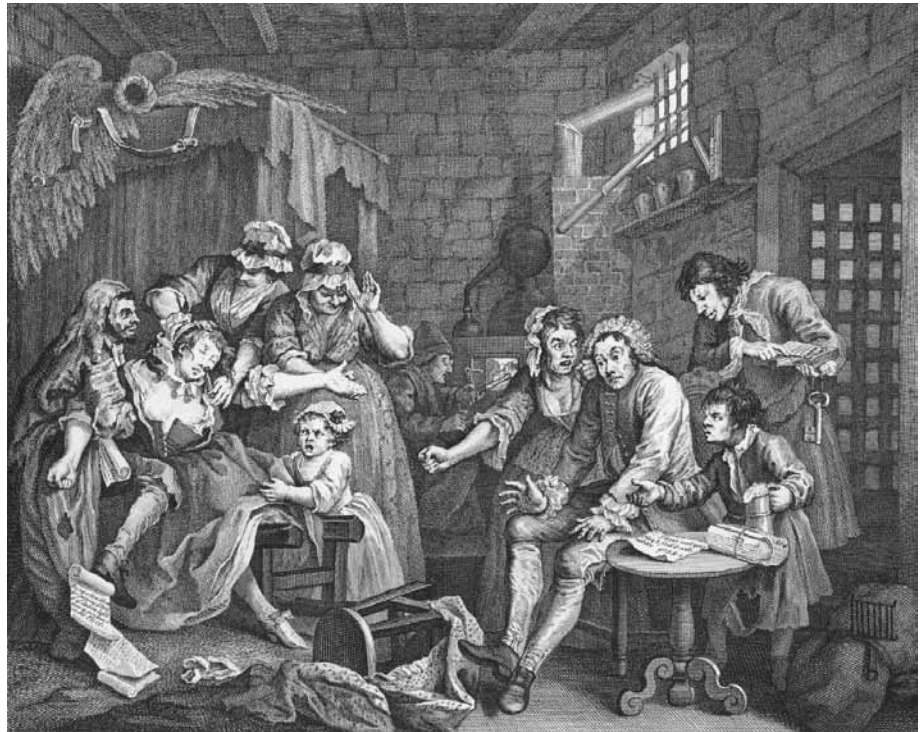
The British monetarist system at work: William Hogarth's "The Flood Debtors' Prison," from "A Rake's Progress," ca. 1733. The 1825 London banking collapse and panic would have spread to the U.S., had it not been for Biddle's Bank.

In 1825-26, even in the midst of a government debt payment, Biddle protected the American economy from one of the greatest speculative waves of the century, centered in London, by taking measures to prevent all branches of the Bank from engaging in the excessive lending, beyond the actual needs of the economy, and keeping the Bank in a position to prevent a bank panic due to occurrences on the London market. When all state banks had closed their doors and a general panic was threatening the country, his Bank prevented interstate specie drains by coordinating through its branches, initiating a gradual supply of credit, even though 104