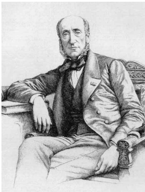
Frenchman Michel Chevalier (1806-79) visited the United States in 1834-36, and liked what he saw. He wrote: "A metallic currency, has, in our [European] notions, a superiority to any other representative of value, which to an American ... is quite incomprehensible; to our peasants, it is the object of a mysterious feeling, a real worship; and, in this respect we are all of us more or less peasants."

It was only through this system that the opening of new lands became possible, to the extent that was carried out. With this system of credit, any free man inspired with the spirit of invention, would not be inspired in vain. Chevalier pointed out that this was not the case in Europe, where manufacturers, smiths, masons, canal