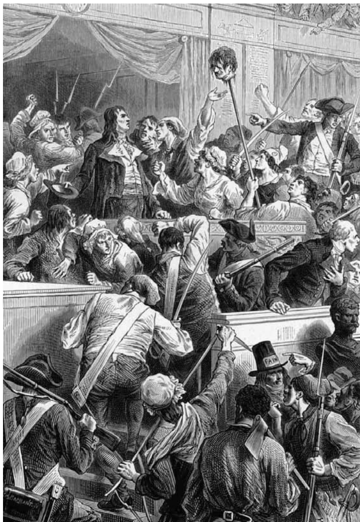
In pure democracies, the passions and opinions of the mob are allowed to run loose, until people virtually beg for a tyrant to impose order. That was the British strategy in the mob-dominated French Revolution, depicted here.

“‘Owing to this licence, it includes all kinds, and it seems likely that anyone who wishes to organize a state, as we were just now doing, must find his way to a democratic city and select the model that pleases him, as if