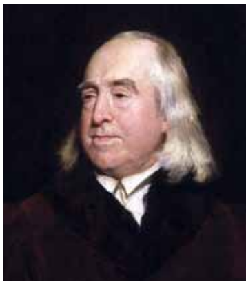
Painting by Henry William Pickersgill (detail).

“Nature has placed mankind under the governance of two sovereign masters, pain and pleasure. It is for them alone to point out what we ought to do, as well as to determine what we shall do.... Every effort we make to throw off our subjection, will serve but to demonstrate and confirm it. The principle of utility—the greatest happiness or greatest felicity principle—recognizes this subjection, and assumes it for the foundation.... Systems which attempt to