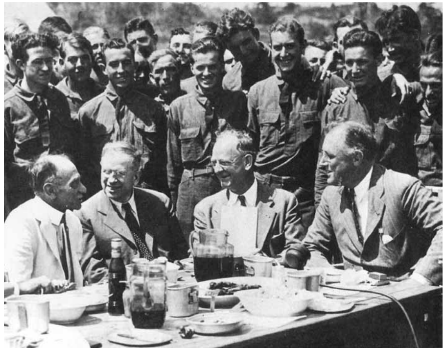
In a republic, leadership involves raising up the population through informed dialogue. Exemplary was the Presidency of Franklin Delano Roosevelt, shown here socializing with government officials, and the workers, at a Civilian Conservation Corps camp.

All good law or government must presume that it is truth, not opinion, which must reign in a form of government qualified to survive. The famous European