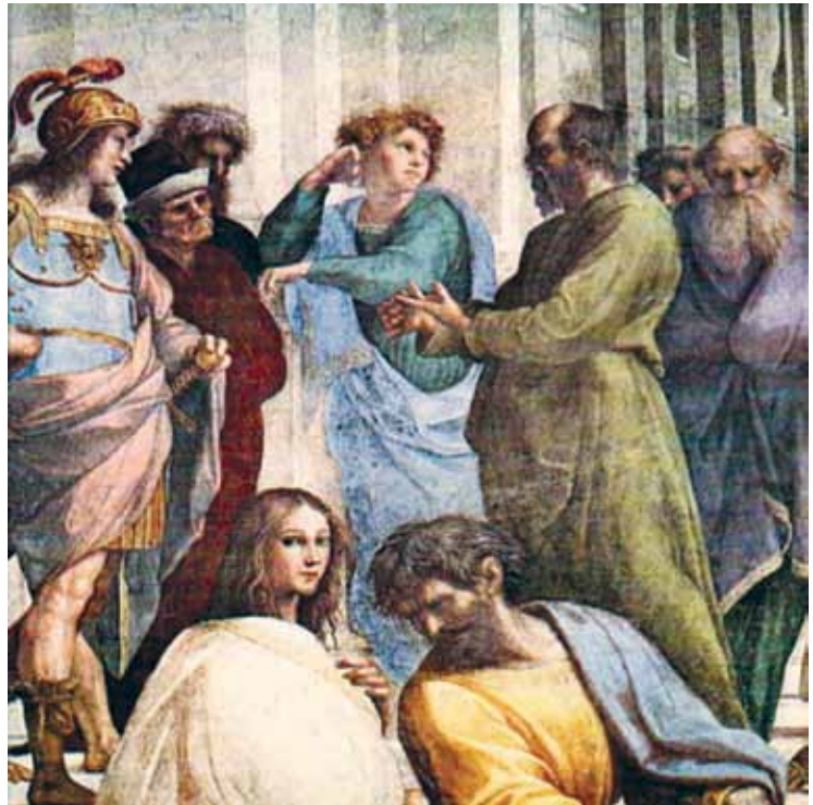
The Socratic method represents a mortal threat to the oligarchical and democratic system, as his judicial murder by the Democratic Party of Athens reflected. Socrates is depicted here in dialogue, with hands outstretched. Detail from Raphael's "The School of Athens" (1509-10).

The five forms of government are: 1) the republic, which could also be called the rule by the best, an aristocracy; 2) the timocracy, a society ruled by those seeking honor (public approval); 3) the oligarchy, ruled by the successful seekers of wealth, above all other goods; 4) democracy, in which the "will of the people" rules; and 5) tyranny, in which the strongman comes in to impose order in the face of the chaos created by democ-