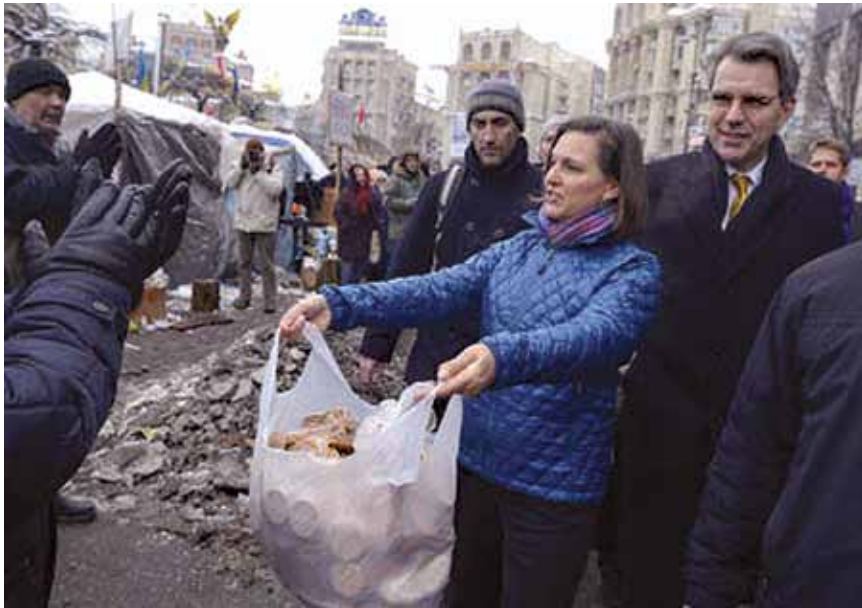
Assistant Secretary of State Victoria Nuland, (aka Mrs. Robert Kagan), hands out cookies in Kiev's Maidan, during the neo-nazi-led putsch against the elected government of Ukraine. With her is U.S. Ambassador to Ukraine Geoffrey Pyatt.

British power in the nineteenth century, and when Britain faltered between the two world wars, that liberal economic order was not passed smoothly on to a new group of supporters. It collapsed. . . . It was only when the U.S. took on the task of creating and sustaining a liberal economic order after World War II that it took hold, and then only in those parts of the world not controlled by the Soviet Union or China” (pp. 37-38).