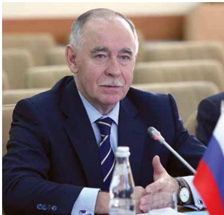
Director of the Russian Federal Drug Control Service Victor Ivanov, at a meeting in Moscow on March 26 of anti-drug experts of the BRICS countries.

Historically, under the Taliban, the area sown to opium poppy declined from 63,000 hectares in 1998 to 8,000 hectares in 2001—an eight-fold decline—while during the period of Operation Enduring Freedom, it increased to an unprecedented historical record of 209,000 hectares, that is, a 26-fold increase! And this means a 26-fold increase in the social base of narcotics production, so that more than 3 million farmers are in-