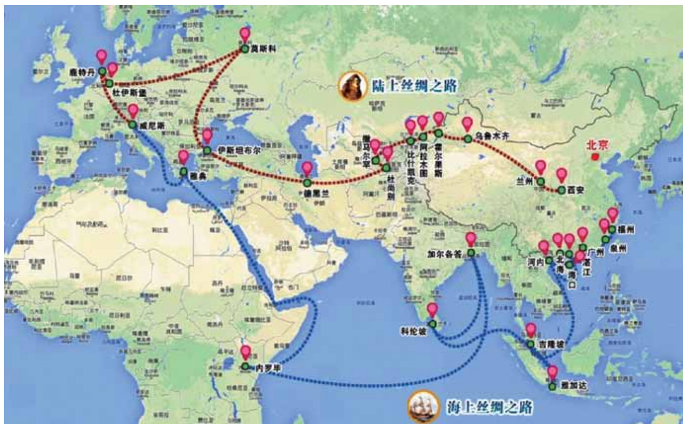
FIGURE 2 China's New Silk Road and Maritime Silk Road

That's not what "win-win" means. "Win-win" means that man is a unique species, which can develop in such a fashion, that he's always producing an increased level of productivity, vis-à-vis the nature that surrounds him, making it possible, though increased energy-flux density, for man to be increasingly in control of, and perfecting his relationship with, the universe.