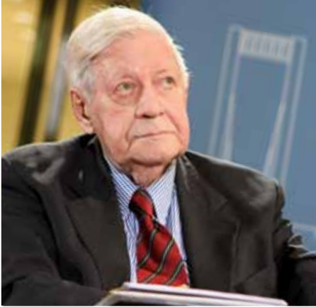
Creative Commons/Ole Reissmann