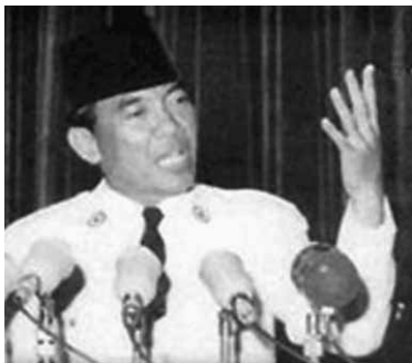
Indonesian President Sukarno at Bandung in 1955.

The following is excerpted from Indonesian President Sukarno's speech to the 1955 Bandung Conference.