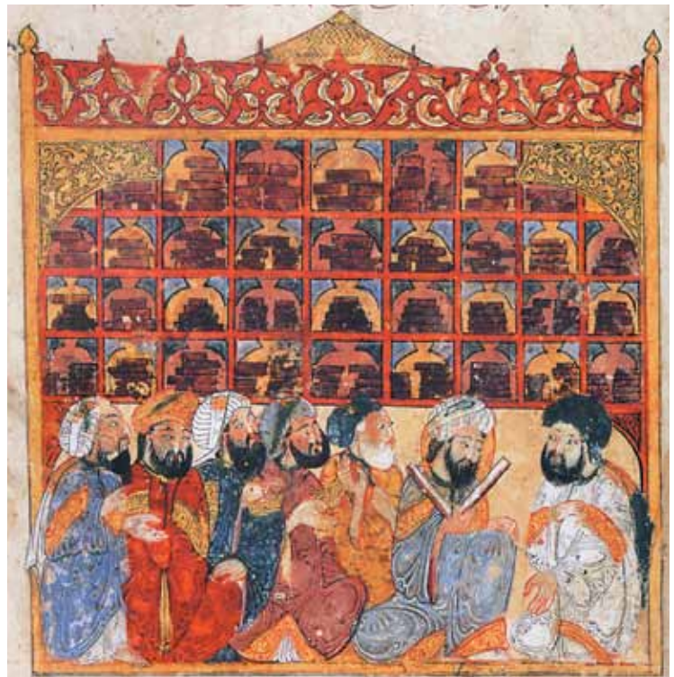
Maqamat al-Hariri Library, illustration by Yahya al-Wasiti, Baghdad 1237

Greek geometry and mathematics were fused with the Indian numbering system (so-called Arab numer-