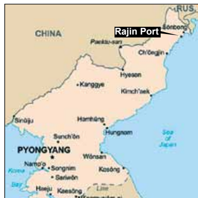
Location of North Korea's ice-free port at Rason, formerly called Rajin-Sonbong.

As for North Korea, although even China has denounced its continued nuclear weapons development program, I would note that the North Koreans have observed what was done to Iraq and Libya after they gave up their nuclear weapons programs to appease the West,— only to