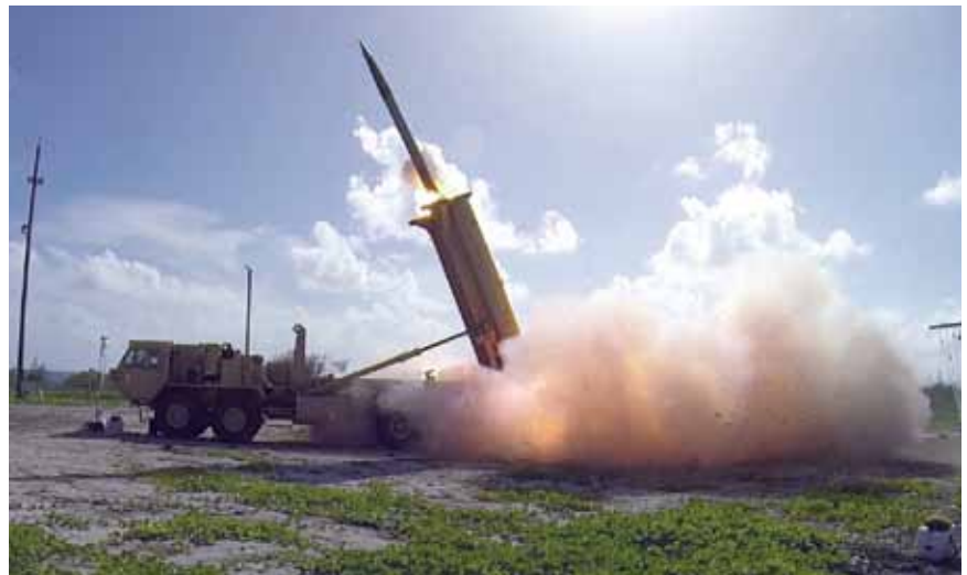
Missile Defense Agency

These development projects are perceived as a threat