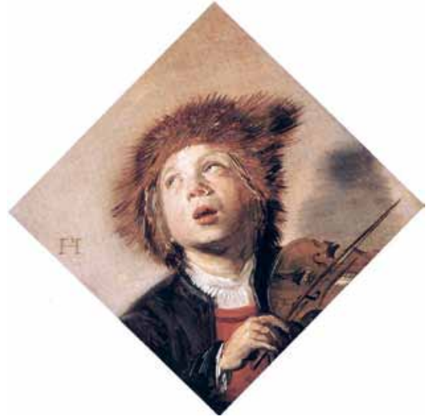
The orchestral and keyboard instruments, designed for a well-tempered scale pivoted upon C=256 , were developed in imitation of the characteristics of the bel canto voice-species. Pictured 'Counterclockwise from above are moments in this history: angels singing polyphonic music (detail from a 15th-century Flemish painting); boy violinist (by the Dutch artist Frans Hals, early 17th century); man playing the newly invented type of flute (by Antoine Watteau, French, 18th century).

ence. First, for the information of the person who has Alexander Pope's "a little learning" concerning physical-science matters, we emphasize that Isaac Newton did not "discover universal gravitation." Newton's famous Gm_1m_2/r^2 is merely an algebraic manipulation of the algebraic formulas representing Kepler's famous, universal three laws of motion. 3 Newton discovered nothing; rather, by the algebraic oversimplification in Newton's parody of Kepler's laws of motion, Newton