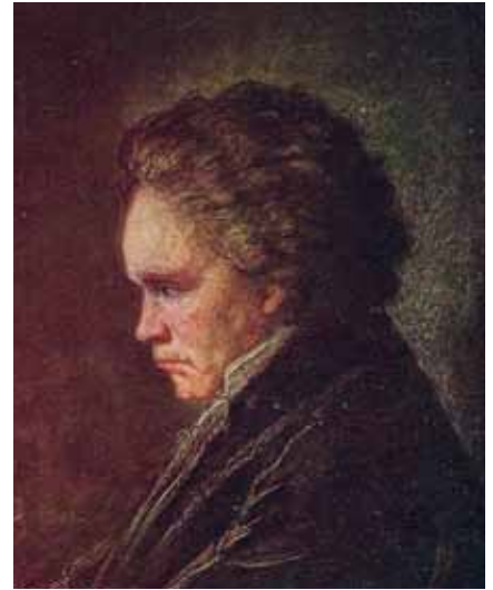
Left to right: Franz Schubert (1797-1828), Wolfgang Mozart (1756-1791), and Ludwig van Beethoven (1770-1827) each developed the proposition in Bach's Musical Offering , showing "the seamless union of scientific methods of musical composition and beauty."

musical composition and beauty. A proposition is presented, yet once again, for a yet-more-ingenious solution. The solution is bounded by strict classical rigor; the rigor pertains to the way in which a creative modification of the rules is permitted, on behalf of a solution.