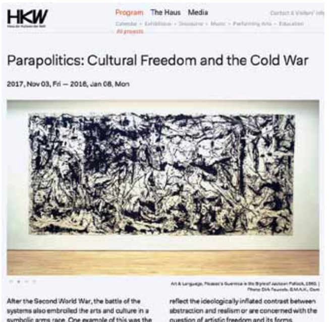
Berlin museum exhibit on the Congress for Cultural Freedom.

In music, the CCF started a vicious campaign against Furtwängler; and instead of Classical composers, it pushed atonal, twelve-tone music, such as that of Alban Berg, Schoenberg, and Webern, and eradicated the idea of polyphonic harmonic composition. The famous writer, Susan Sontag, said, “We knew we expected to accept ugly music as pleasant.” That is what