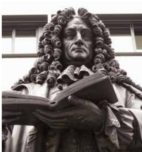
Statue of Gottfried Leibniz.

He said that Confucianism has much more to offer than any other known belief system of his time. He said, “We need the Chinese to send missionaries to Europe, so that we can learn from them the natural religion that we have almost lost.” He proposed an exchange of cultural ambassadors, which for his time was a very modern conception. He said, “There is in China a public morality, admirable in certain regards, conjoined to a philosophical doctrine, or rather a natural theology venerable by its antiquity, established and authorized for about 3,000 years, long before the philosophy of the Greeks.”