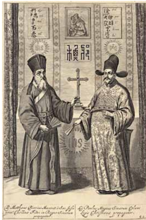
Matteo Ricci (left) and Xu Guangqi.

According to Leibniz, “God has created the universe by the way of a pre-stabilized harmony, where the realm of the spiritual and the material world, the soul and the body are in total correspondence. This is so, because God—in His divine anticipation—has created the material and spiritual substance in such an ordered way and with such a precision, that even if they follow their own lawfulness embedded in their nature, nevertheless there is such a cohesion as if there existed between them, a reciprocal inference. And as if God, apart from His general contribution, were to act concretely in each single instant. Each monad, each uniform substance, reflects in germ the entire universe at large. But they only relate to each other because they take part in the absolute being of God.”