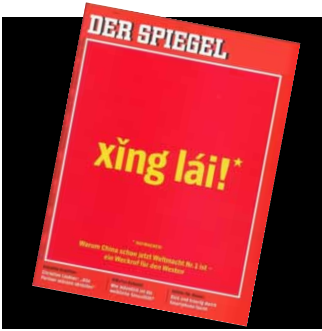
German weekly, Der Spiegel, calls for the West to wake up to the alleged threat from China. Xǐng lái is a Chinese expression meaning “wake up.”

glo-American special relationship in the tradition of Churchill and Truman in the postwar period, and what the neo-cons started to build after the collapse of the Soviet Union. As you can see in the revolt against the system: whether it’s Brexit or the defeat of Hillary Clinton in the U.S. election, the “no” to the referendum in Italy, or the pitiful collapse of the “Jamaica” coalition talks in Germany. The talks collapsed because none of the participating parties had any vision for the future, or any substantive ideas.