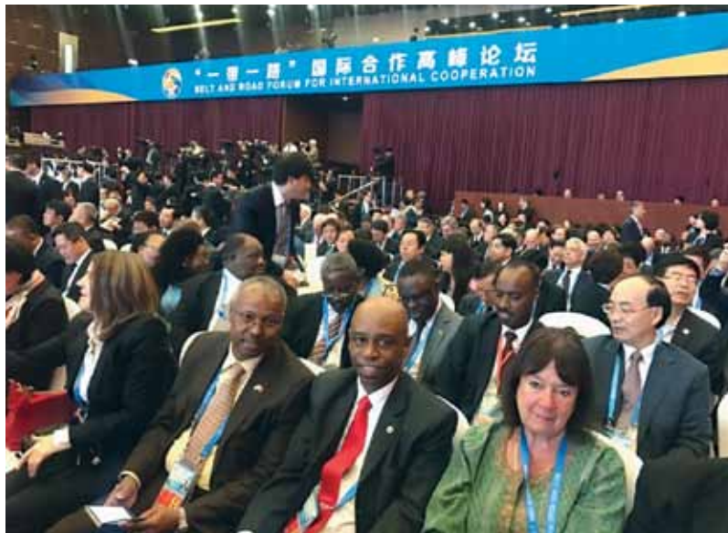
Helga Zepp-LaRouche, front right, with other non-governmental representatives, participating in the Belt and Road Forum for International Cooperation in Beijing, May 2017.

The “spirit of the New Silk Road” is already transforming this whole geometry. Other roads have been added: the Polar route, and branches on other continents, Africa and the Americas, of what the LaRouche movement calls the “World Land-Bridge.” In yet other dimensions, there is cooperation in space exploration and deep-sea exploration, and also cooperation in web protocols and rules to strengthen communications in the