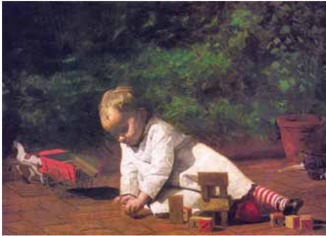
Baby at play by Thomas Eakens.

Writing under the pen-name “M. Ilyin,” Ilya Yakovlevich Marshak (1896-1953), another Russian chemist, boldly committed himself to encouraging children to devote their lives to science. Even if stained by Stalinism, his books popularizing science have the same inspiring quality as Jules Verne’s novels. The preface of his How Man Became a Giant (1948) is poetic: