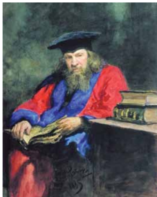
Painting of Dmitri Mendeleev by Ilya Repin.

to the world, particularly economic infrastructure, which development in Russia was an object of his teacher Mendeleev’s dedicated effort. For Vernadsky, Man is a “geological force,” but a force with the advantage of not being blind like the aforementioned geological upheavals preceding man’s emergence.