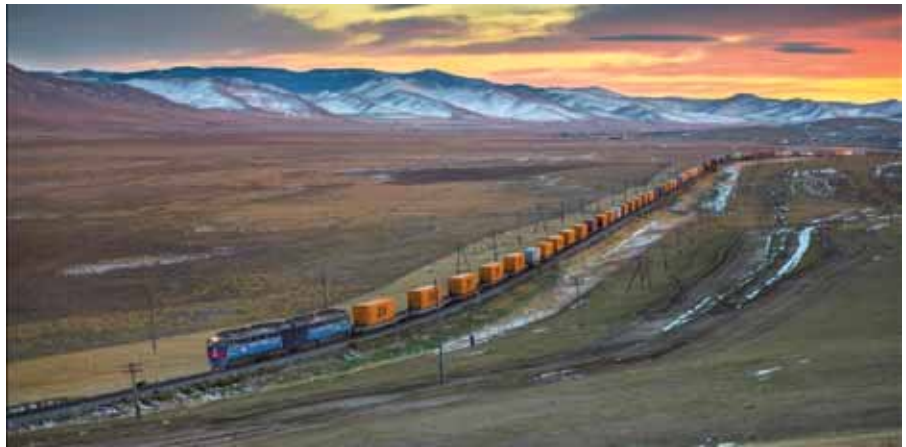
Container freight train en route from China to Duisburg, Germany.

We should denounce the fact that the then-Italian Prime Minister Mario Monti, while making a pro forma declaration in favor of cooperation with China, nevertheless refused the financial aid that China had offered us (being aware that our peninsula is the “stable link with the European hinterland”) to help build the long-proposed Messina Strait Bridge between Sicily and the Italian mainland. Subsequently, he shut the project down, claiming lack of funds.