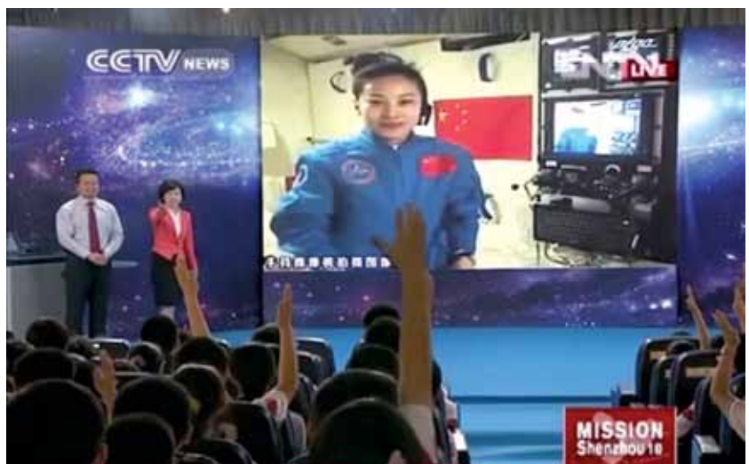
Chinese students in a class, conducted from space, by Wang Yaping aboard the Shenzhou 10 space mission.