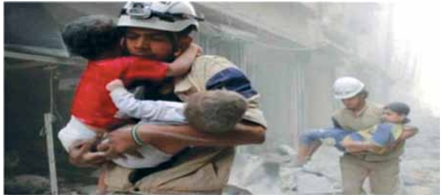
The pro-jihadi White Helmets are lavishly funded by the UK, Obama’s USAID, and Dutch, French, Danish, and Japanese governments.

Imagine that Schwabing [a district in the northern part of Munich, the capital of the German state of Bavaria—ed.] was occupied by thousands of ISIS fighters who held the civilian population hostage—partly in cages—and bombarded schools, hospitals, and markets in Munich from Schwabing. Or imagine Schöneweide in relation to Berlin. This is roughly comparable to the situation in which the Syrian government finds itself with regard to the East Ghouta suburb of the capital,