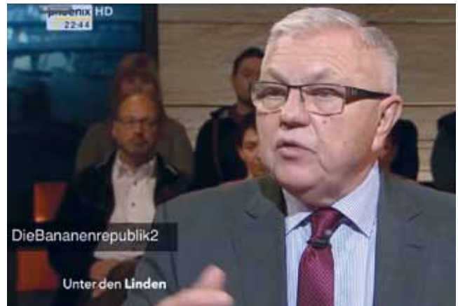
Gen. Harald Kujat

Obviously, this principle is guiding the various think-tanks, from Australia to the U.S.A. and Europe, that are currently depicting Russia and China as an acute threat. A particularly lunatic example has just been provided by the Washington Center for Strategic and International Studies (CSIS) with a report entitled