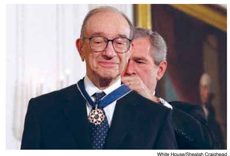
About the time that President Bush was awarding Fed chairman Alan Greenspan the Presidential Medal of Freedom, in 2005 (shown here), Greenspan's galactic-size bubble, built up since 1987, had begun to burst.

Now, what you do under this case, and with agreement with the United States, and its Constitution, with Russia, China, and India, it can be done. What you do, is you say, we put all the claims which are equivalent of monetary or credit claims in two piles. One pile we call "monetary." That's the manure pile. The other we call the "credit" pile. Now under the U.S. Constitution, money, when the Constitution is followed, is created only by the will of the government. It is done by the Executive branch of government, with the consent of the House of Representatives, and things flow from that. This credit being issued, is also authorized for monetization: So, the credit can be issued as loans for projects, or international loans, and part of it can actually be monetized, under the condition under which it was uttered. Particularly, if we had a national banking system, which we don't have presently, we could convert the Federal Reserve System, which is bankrupt,