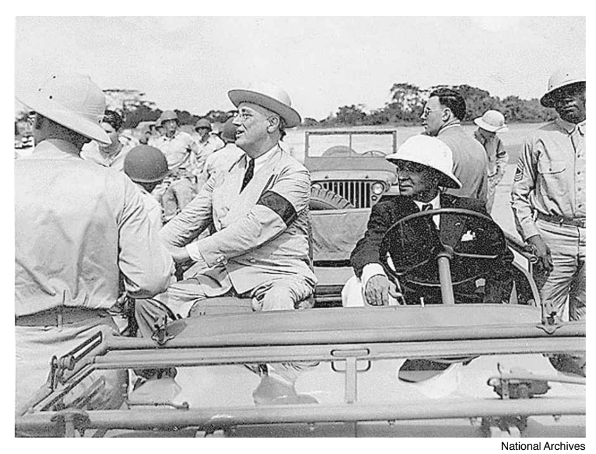
Franklin Roosevelt's intention was to eliminate all imperialism and colonialism, and to use the vast economic power the United States had assembled during the war, to build up other countries, and to establish a system of nation-states. FDR is shown here with President Edwin Barclay of Liberia, January 1943.

Asia in general; the Siberian area and below, is a repository of concentration of raw materials which are necessary for the development of Asia as a whole. But you just can't go in there, and get those raw materials; you have to have a system of development, which develops the territory in which the raw materials lie. You can't just go down and dig them out. You have to have a system, and Russia used to have a system of that type, under the old Russian system, in infrastructure, in minerals. And therefore, to develop this area, you require large-scale, modern transportation systems; you need power systems, which means nuclear power systems, and so forth; otherwise you can not develop these territories. This means developing magnetic levitation systems in place of rail systems, restoring rail systems where they fit the bill, and all other kinds of infrastructural development which are necessary for high-technology investment and production. Without that, we can not accomplish our mission.