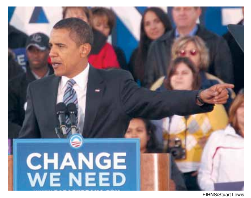
Our system, LaRouche stated, is not a system of a President; it is a Presidential system, which involves the entirety of the Federal government. Shown: President-elect Obama campaigning in Leesburg, Va., Oct. 22, 2008.

the United States and for its allies. So that's what's required.