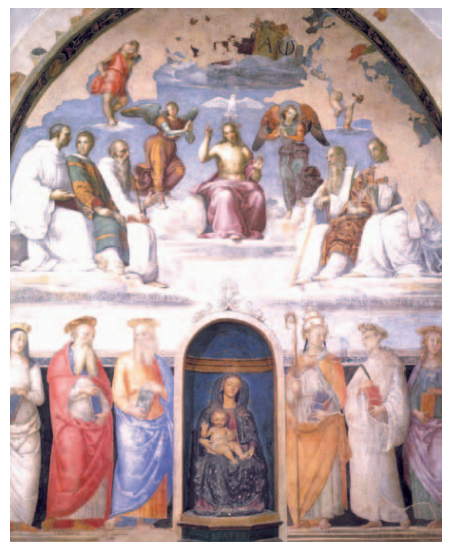
"Only as triune can God be completely seen." —Nicholas of Cusa. Shown: The Holy Trinity, a fresco by Raphael and Perugino. In the upper panel, Christ, the Son, is seated, flanked by saints and angels; the Holy Spirit is represented by the dove above his head; the image of the Father at the top is lost through deterioration, except for His attribute, the open book showing alpha and omega. The fresco is in the Chapel of San Severo, Perugia, Italy.

turn leads him one step further, and says: "Only as triune can God be completely seen." And, as in so many places in his work, he defines the trinity of God in a more profound way, one less liable to be misunderstood, than is often understood in the definition as Father, Son, and Holy Spirit.