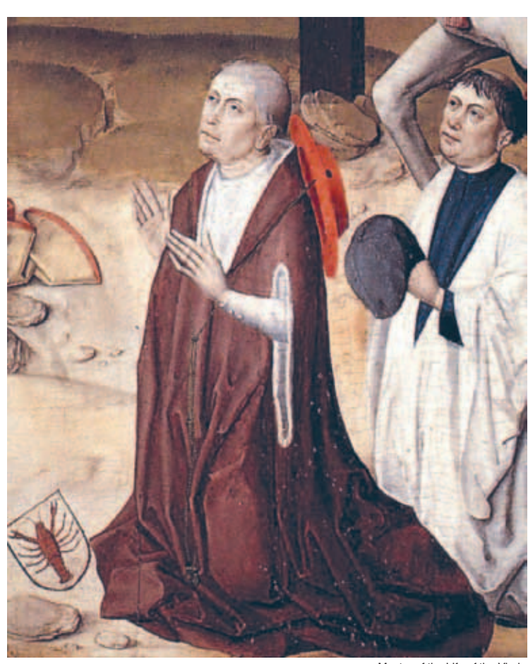
Master of the Life of the Virgin

"Who is there, who will not be enthralled to physi the highest degree, when he attentively reflects upon this?" says Nikolaus Cusanus in enraptured enthusiasm in the 19th chapter of De Visione Dei . Cusanus continues, "Thou, my God, dost reveal unto me, poor human, one such mystery ..., that to see Thee means at once to be united with Thee." Indeed, although this work is probably the most difficult among the theological-philosophical writings, it is also written in such a gripping way, that a sympathetic reader can not avoid