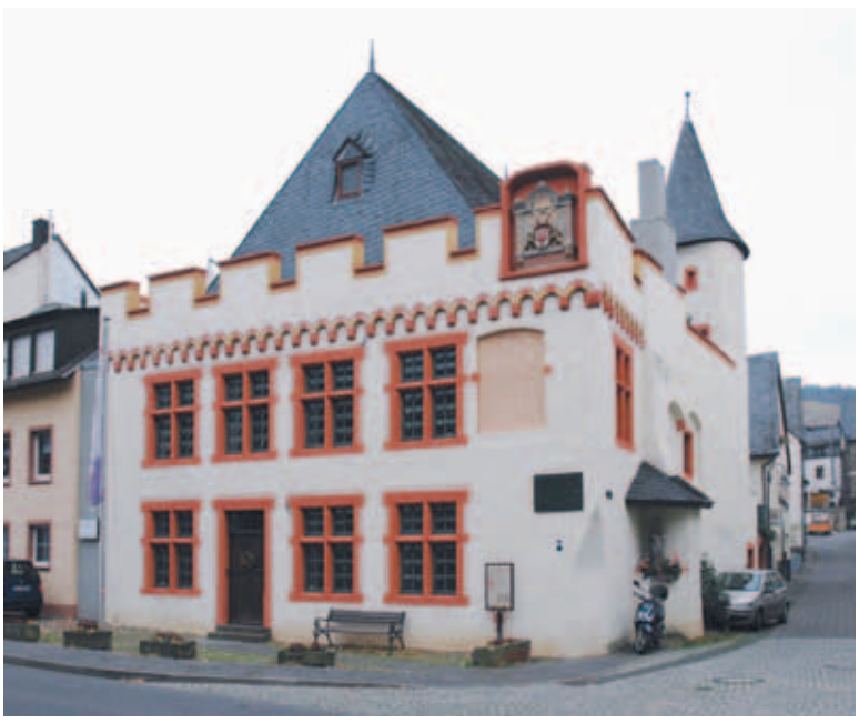
Sir Gawain / Wikimedia Commons / CC-BY-SA-3.0

The person of Christ is thus the mediator, He is both absolutely united with God, as well as absolutely the Son of man. Through Him, human beings can fully partake of God, if they want to. It depends upon the person himself, whether he wants this unification of human nature, and through the person of Christ, this unification is "nothing else than the greatest possible drawing of human nature toward the divine, in such a way, that human nature as such can not be drawn any higher."