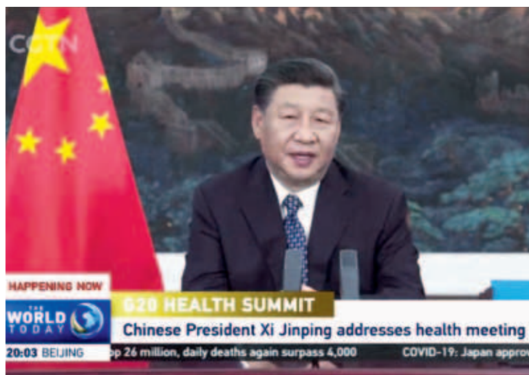
Chinese President Xi Jinping.

Xi Jinping elaborated a five-point program in which he said that there must be a "global community of health" and that the lives and health of people must be put "front and center," and that we must guarantee that every single life is protected. This has been the foundation of the policy of the Chinese government in fighting