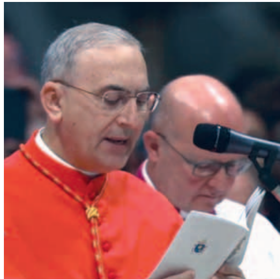
CC/Centro Televisivo Vaticano

We have to have development: “The new name for peace is development.” That is what Cardinal Zenari said, and frankly, given the complexity of the region, I don’t think there is any chance to solve the Israel-Palestine crisis, or any of the other situations unless there is an end to geopolitics among the large powers. The United States, Russia, and China, have to cooperate. Then you can solve the problems in the Middle East easily. It has been used as a cockpit for geopolitical confrontation for a very long time. The plan to solve it starts with the New Silk Road, which President Xi offered as a viable economic plan in 2015, when he visited Iran, Saudi Arabia, and Egypt. He proposed extending the New Silk Road into the whole region.