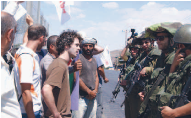
CC/Palestine Solidarity Project

“Some of the same people who are running the Israeli nuts, are also recruiting certain Islamic nations, people of Islamic persuasion, to do similar kinds of things.” —Lyndon LaRouche. Here, a demonstration outside the Palestinian town of Beit Ummar.