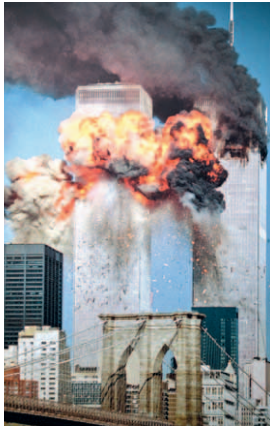
The Twin Towers of the World Trade Center in New York City, shortly after both were struck by hijacked commercial airliners, September 11, 2001.

What we're getting now, is it appears that one airplane hit each of the two towers. And I mean, that's