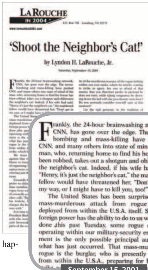
September 15, 2001 LaRouche in 2004 A LaRouche campaign leaflet written by Lyndon LaRouche and issued September 15, 2001.

LaRouche: The same thing. The President of Mexico, presumably the one guy who George W. Bush would know where to find him, came to Washington to meet with the President; brought up an agenda which the President should have been informed about beforehand, undoubtedly was; and the President meets with President Vicente Fox on this question of immigration, which we ought to have a working understanding on. If you don't have the final solution, at least you can be working on it, and say we're going to work on it. We don't. He turned it down, the President. Publicly turned it down.