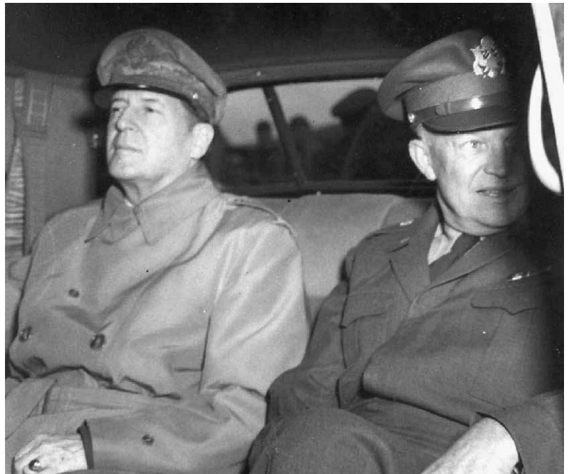
President Franklin Roosevelt's (left) relations with the Soviet Union, and the postwar efforts by Generals Douglas MacArthur and Dwight Eisenhower, were no "conspiracy." What was operative, LaRouche writes, "was a clear sense of the threat to the U.S.A. embodied in the British empire's efforts to pit the United States against both the Soviet Union and China, and also, both against us, in return." MacArthur and Eisenhower are shown here in Nikko, Japan in 1946.

ferently, but I know now that the issue was the same. Naturally, as a practical matter, when measures had to be taken, that might have appeared to some onlookers as being a kind of conspiracy. That would be a mistaken assessment. If one meant "a conspiracy" in the dictionary's sense of a common devotion, the word applies; but, if what is intended by that term, were to convey a sense of commitment to some secret association's plot, the imputation were worse than false.