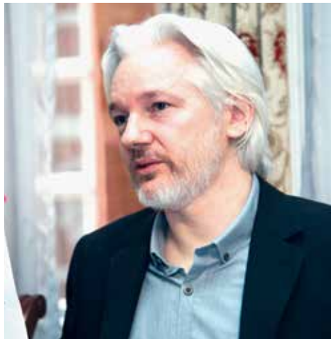
WikiLeaks publisher Julian Assange: Russia didn't hack the DNC computers.