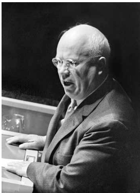
Nikita Khrushchov put Soviet missiles in Cuba to counter U.S. missiles in Turkey.

The idea of any American official today visiting the Russian Embassy in Washington, D.C., with Anatoly Antonov [Russian Federation Ambassador to the U.S.], is just simply out of the question. Even during Russiagate, the Russian Ambassador was talking to [U.S. National Security Advisor-designate] Michael Flynn and others. Russiagate has closed those diplomatic options and those backchannels. So the legacy, the awful, dangerous legacy of Russiagate impinges and affects a whole spectrum of behaviors, and of course has led to