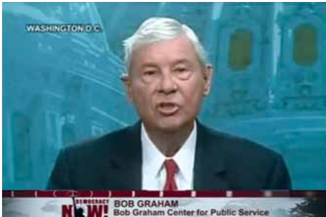
Former Senator Graham has continued to press the issue of reopening the 9/11 investigation and releasing substantial sections of the redacted 28 pages. He is shown here on Sept. 15, 2011.

In a Sept. 15, 2011 interview on Democracy Now!, Graham described the Saudi “support network” for the 9/11 terrorists that the Congressional Inquiry had uncovered earlier in San Diego, and said, “We’ve just learned about another pod of this network in Sarasota.”