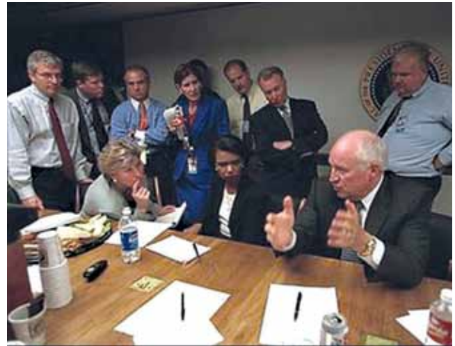
Vice President Dick Cheney, National Security Advisor Condoleezza Rice, and senior staff immediately after the 9/11 attacks. The coverup begins.

And, it wasn’t just the State Department that gave