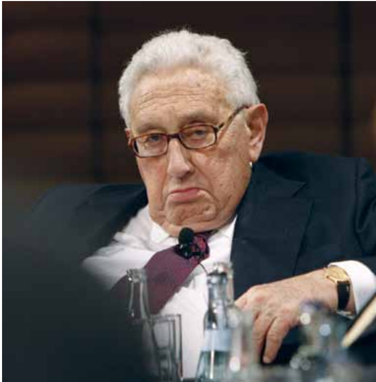
2012 Munich Security Conference

Henry Kissinger was Karl Rove's first choice to head the independent 9/11 Commission, but he resigned abruptly after being asked by 9/11 family members, "Do you have any Saudi clients?"